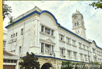
Malayan Railway Building