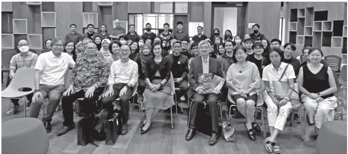
Group Picture featuring Speakers, SHS Committee members and participants.