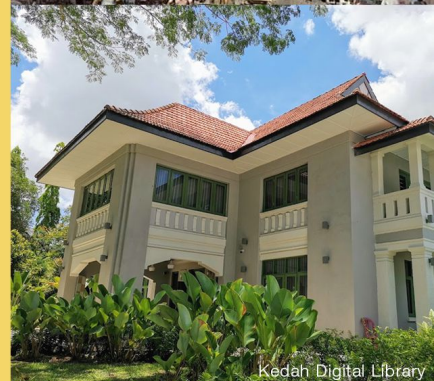
Kedah Digital Library