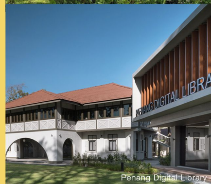
Penang Digital Library