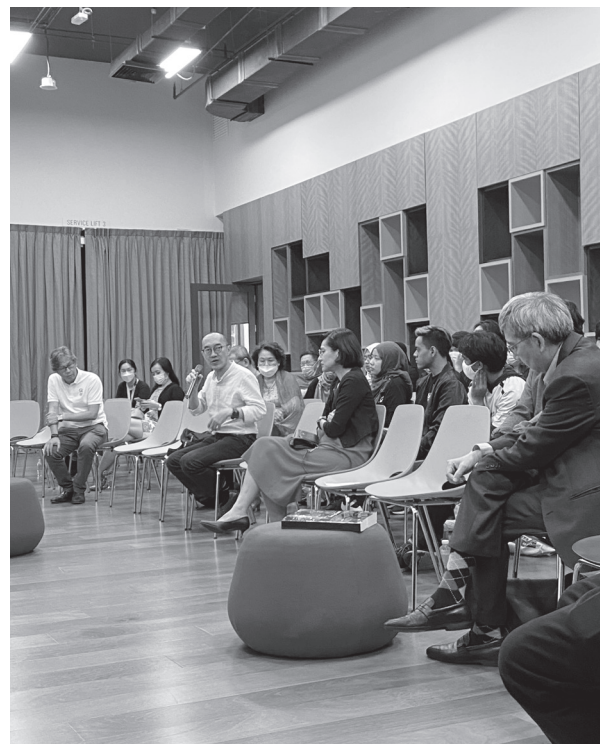
Question & Answer Session.